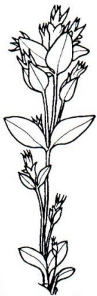
G. aleutica (from Hultén)

Hultén differentiates the subspecies aleutica from propinqua largely by the shape of the calyx lobes. Calyx lobes of G. propinqua subsp. aleutica are described as broad, foliaceous, reflexed and somewhat acute, with a bluish white corolla, while those of G. Propinqua subsp. propinqua are lanceolate, markedly acute and the corolla is bluer. See the comparisons below.